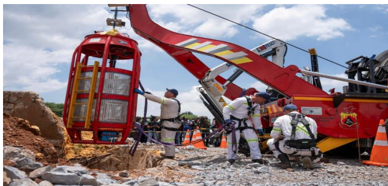
Figure 1: Assessment of Rescue Tools

Additionally, drones and robotic devices are increasingly being utilized to access hard-to-reach or hazardous areas within collapsed mines. Drones can fly into narrow or obstructed spaces to assess the situation, locate trapped miners, and relay live video footage, significantly improving situational awareness. Robotic devices, including remotely operated vehicles (ROVs), are capable of navigating through debris to perform tasks such as removing obstacles, searching for survivors, or retrieving materials. These devices reduce human exposure to life-threatening conditions and improve the speed and accuracy of rescue efforts.