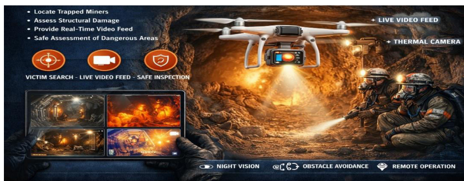
Figure 4: Drones and Unmanned Aerial Vehicles (UAVs)