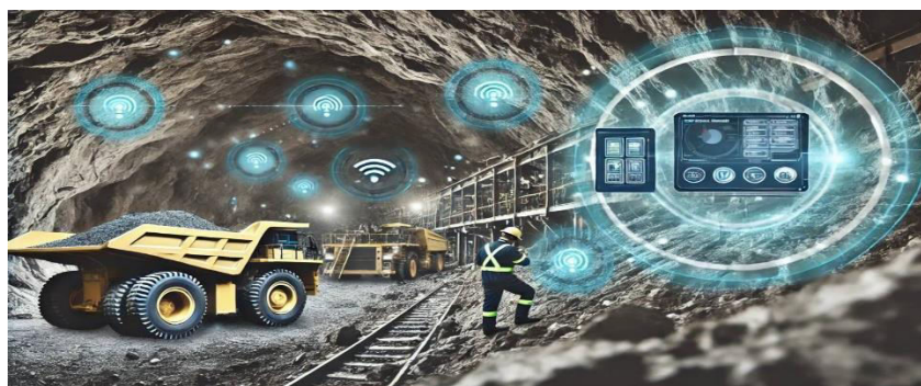
Figure 5: Robotic and Communication Systems

Robotic devices, such as remotely operated vehicles (ROVs) and autonomous rescue robots, are becoming increasingly important in mining rescue operations. These robots can navigate through rubble, debris, and confined spaces to locate victims, clear obstacles, or even perform essential tasks such as fire suppression and debris removal. Robotic systems are particularly useful when access is restricted or when the structural integrity of the mine is too unstable to allow human rescuers to enter. Advanced robotic systems are also equipped with sensors to detect the environmental conditions, such as gas concentrations and temperature, ensuring that rescuers have the most up-to-date information to make critical decisions.